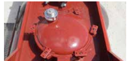
(Photo 3) Manway lid showing corroded rubber lining, due to HCl exposure. (Photo 4) Manway lid and surrounding spill area properly protected with ChemLine® coating.