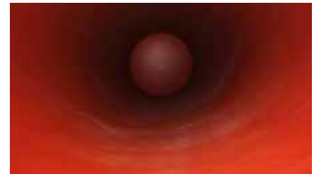
(Photo 1) Interior pitted tank with corrosion prior to ChemLine® application. (Photo 2) Finished tank with ChemLine® coating.