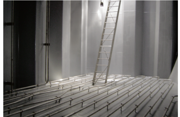
Above, MarineLine® gray colour. New MarineLine® ivory colour option, shown below.

Of course, we will continue to supply the gray colour for the many hundreds of ships that are currently in service, and for owners wishing to continue using this colour. Thank you.