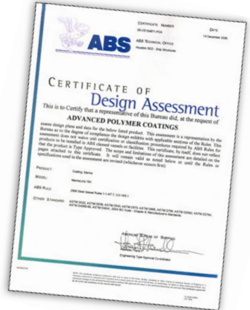
American Bureau of Shipping (ABS) “Certificate of Design Assessment” for the MarineLine® coating system.

Thus, the only institute that can make comments on the coating/lining is the Administration. In some cases class societies will act on behalf of the administration. Currently there are no known lists of approved or non-approved linings and or coatings. Currently The American Bureau of Shipping (ABS) has conferred “Certificate of Design Assessment” designation for the MarineLine® coating system to line and protect tanks in marine chemical tankers, and ABS has also approved MarineLine®-coated vessels for carriage of Sulphuric, Phosphoric, and Acetic Acids. In addition, Bureau Veritas (BV) has approved MarineLine®-coated vessels for acid carriage service.