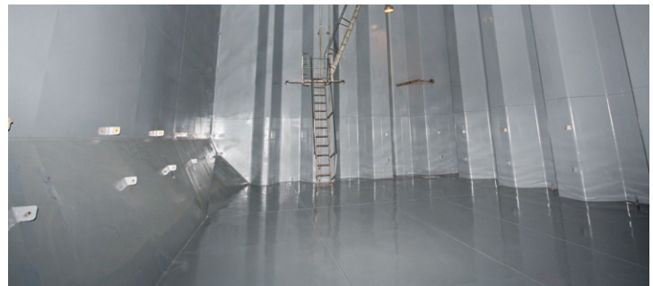
The MarineLine® two coat system, (left) Base coat and (right) Top coat, form an effective acid-resistant lining.